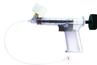
Gun Type Inflation Device