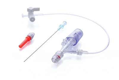
Push-Click Y connector