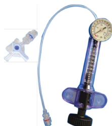
Hybrid Inflation Device