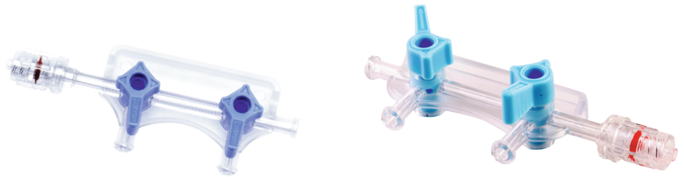
2 - Port